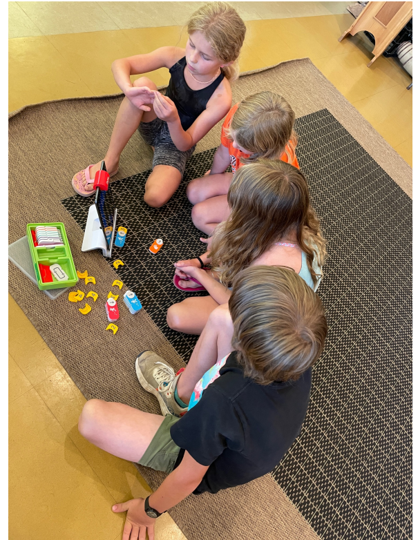
Another design/ engineering challenge. These students are using their grids to create a base using their math, language and problem solving skills.