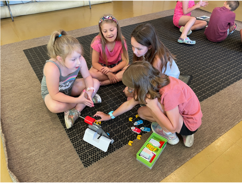
Students hard at work learning how to code!